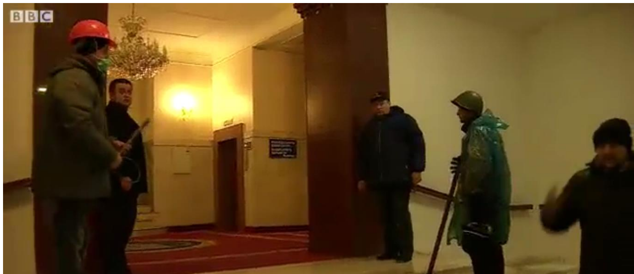
Photo 8. The leader of the Khmelnytsky regional organization of Svoboda party and Maidan protesters guard the entrance to the stairways and the elevators in the Hotel Ukraina during the massacre of the protesters by shooters from this hotel circa 9:51am (Source: “Бои в Киеве: снайперы, раненые и автоматные гильзы,” BBC Russian , February 20, 2014, http://www.bbc.co.uk/russian/multimedia/2014/02/140220_kiev_maidan_wounded_bbc ).

It would have been irrational for the Maidan leaders not to act on such information and deploy the armed Maidan groups to locate and detain or kill these snipers, who continued to massacre the Maidan protesters for a relatively long time period. This specifically concerns Parubii and Yarosh, who stated that they were during the massacre on the Maidan. But such actions become rational if these snipers were not from the government side or “third side” but from the Maidan side conducting a false flag operation. Such false flag operation to succeed in mass killing of the protestors required that it was conducted in secret not only from the government of Ukraine and its forces but also from journalists and the Maidan protesters, including many leading Maidan activists and many Maidan Self-Defense members and commanders with the exception of small minority, that included snipers, spotters, and their security. Specifically Parubii and Yarosh stated in media interviews that they were present during the massacre on the Maidan, but there is not a single publicly available video or photo showing their specific whereabouts and actions at the time of this mass killing. This is another dog that did not bark evidence indicating that the Maidan massacre was a false flag operation by a section of the Maidan leaders and a very small faction of the protesters.