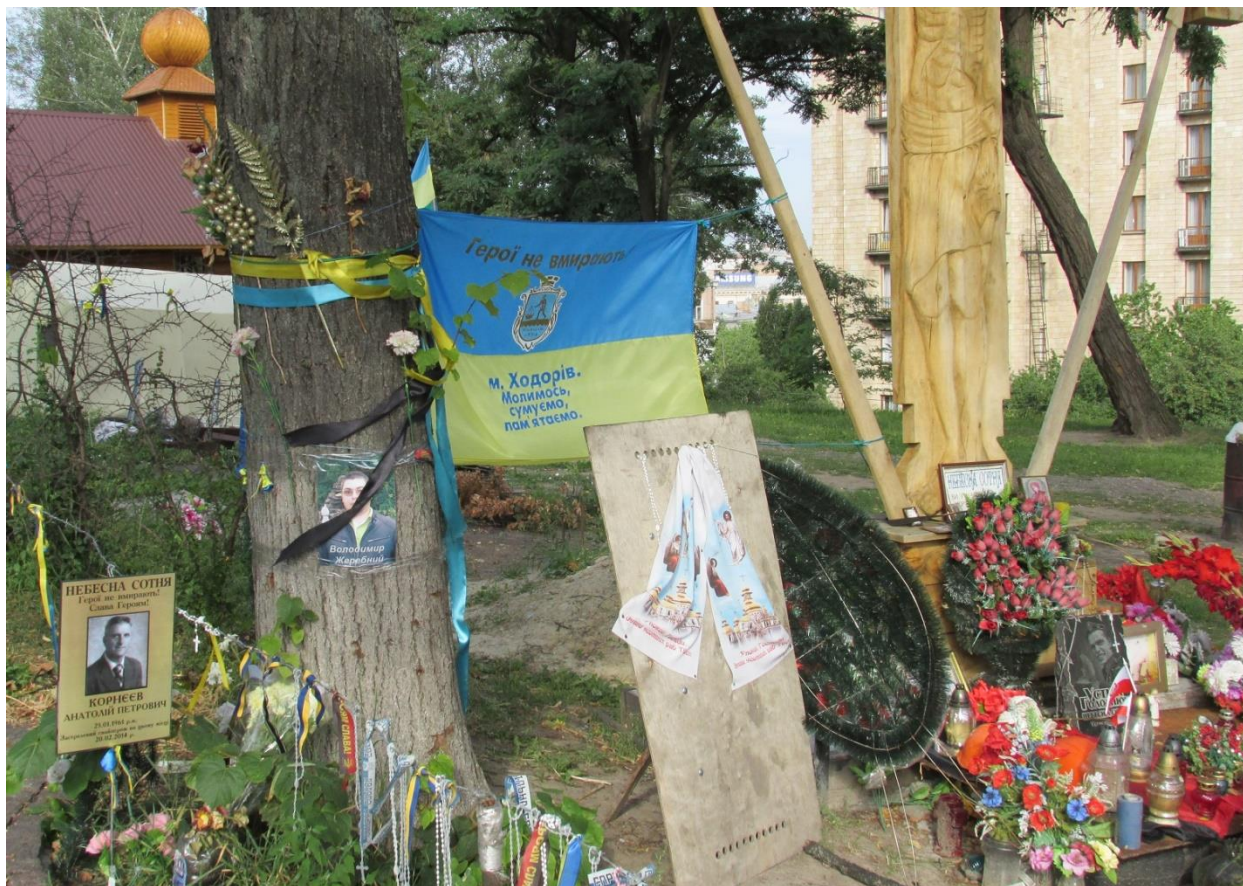
Photo 5. Gunshot impact marks from the directions of the Hotel Ukraina, Zhovtnevyi Palace/Kinopalats and Muzeiny Lane on a tree at the site of the massacre.