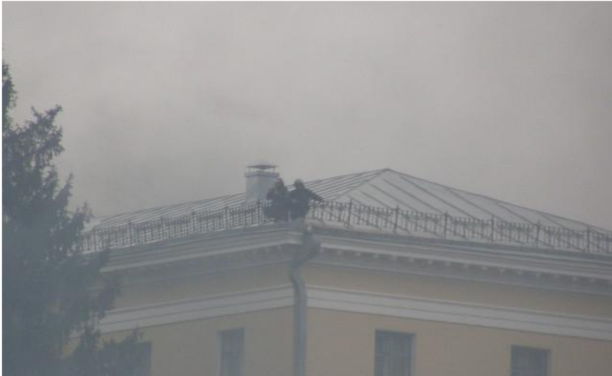
Photo 6. Maidan “snipers” or spotters on the roof of Zhovtnevyi Palace circa 10:00am during the massacre.

Videos, photos, and testimonies of the protesters show that the Maidan protesters seized Zhovtnevyi Palace and that they controlled the entrance, the roof, and windows on the roof during the massacre. Three “snipers” on the roof of Zhovtnevyi Palace were filmed and identified as such from the Maidan stage during wave of killing of protesters at 9:59-10:00am. 222 But a full version of the video of the snipers was not released publicly. The same two “snipers” there were shown by ICTV and identified as such on February 20, 2014. 223 This study also located one of them in the same spot on the top of this yellow building in a BBC video at 10:05am, but his presence there was not previously reported. 224