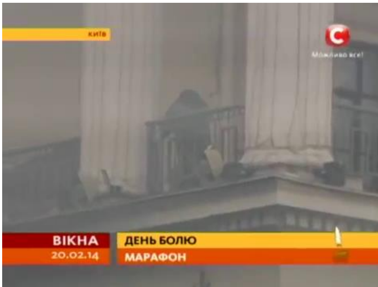
Photo 2. A reported shooter in the Music Conservatory around 8:00am during the mass shooting of the police by Maidan “snipers” from this building.

The Maidan shooter in the BBC and Vesti interviews said that he was among a group of about 20 protesters who were asked at around 6:00pm on February 19 to come forward if they had shooting skills and then given a choice of weapons, which included shotguns and Saiga rifles—which is based on the Kalashnikov assault rifle—before being told to take convenient positions. He saw some 10 other protesters shooting at the police from the conservatory building in the morning of February 20. Maidan eyewitnesses among the protesters said that organized groups from the Lviv and Ivano-Frankivsk regions in Western Ukraine arrived at Maidan and moved to the Music Conservatory several hours after midnight on February 20, and that some of them were armed with rifles. 51 Two hotel rooms of German journalists at Hotel Ukraina were shot at from the direction of the main post office, as a Ukrainian journalist working for the German TV reported on his Facebook page, or from the direction of the conservatory. 52