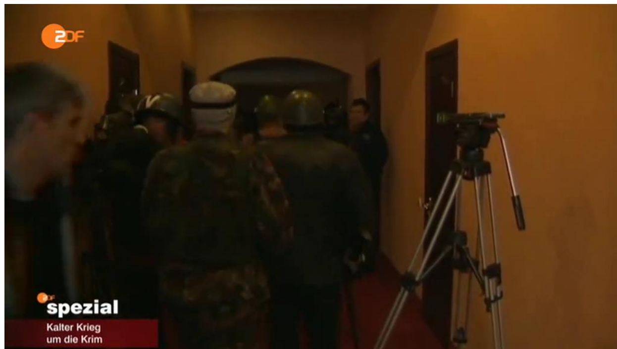
Photo 11. Ruslan Koshulynsky, deputy-speaker of the Ukrainian parliament from Svoboda, with Parasiuk-led group of shooters on the 14 floor of the Hotel Ukraina circa 10:22am during the massacre..

side. But the “roof snipers” were no longer acknowledged and their existence was denied within hours after the opposition members of the parliament went to the roof. An admission by a protester from the Parasiuk’s group that he went to the roof of the Hotel Ukraina but saw no snipers there is another evidence that the “shooters” on the roof were from the Maidan side. 261