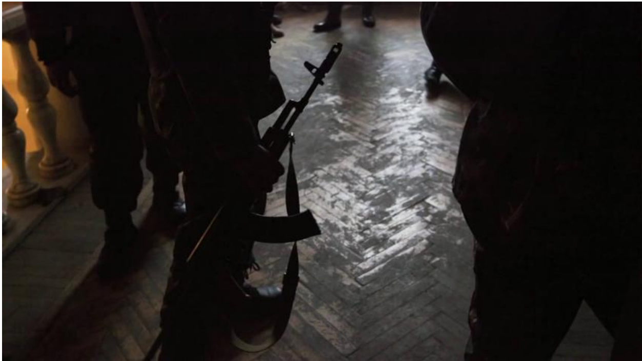
Photo 1. A Maidan shooter armed with a Kalashnikov assault rifle inside the Music Conservatory shortly after 8:00am around the time of mass shooting of the Berkut from this building.

morning before 9:00 am, as well as Berkut throwing Molotov cocktails at the second floor of the conservatory where the shooters were based. A STB news report briefly shows an apparent shooter there around 8:00am. 45 The BBC investigation includes photos showing Maidan shooters armed with hunting rifles and a Kalashnikov assault rifle inside the Music Conservatory shortly after 8:00am. (See Photo 1 and 2). Videos show several members of these police units carried out and put into ambulances some time before 9:00am on February 20. 46 An Interior Troops officer reports being injured by pellets in the Maidan area after 8:00am. In their radio communications, the Internal Troops units, stationed at Maidan near the Trade Union building, made urgent requests for an ambulance at 8:08am, a life support vehicle at 8:21am, an ambulance at 8:29am, two ambulances at 8:39am and five ambulances at 8:46am, before issuing retreat orders at 8:49 and 8:50am. 47